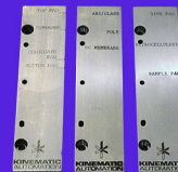
Different keys for multiple products