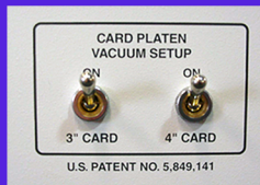
Card platen vacuum zone selector switches