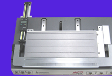
Optional digital micrometer version